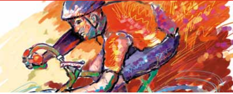
Illustration: Jeanelle McCall